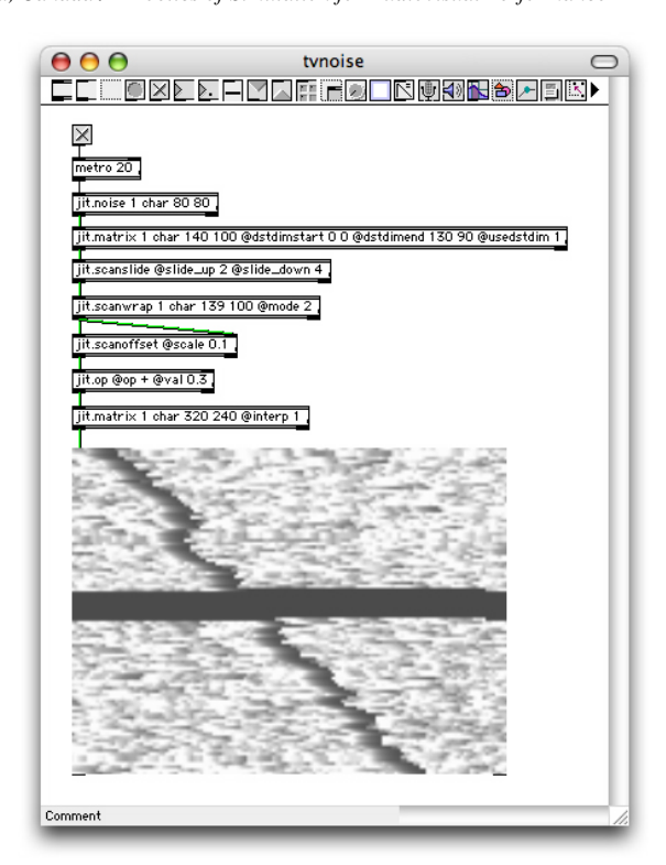
Figure 1: A small Max/MSP/Jitter patch.

The top of the window shows some of the GUI objects available in the environment. The boxes in the window connected with lines are named objects which pass messages. Aside from the top "metro" object, which acts as a metronome, and the "jit.noise" object, which generates a matrix of random values, all of the objects shown here perform transformations on incoming matrix data, the final result of which is seen at the bottom of the patch. Flexible patching environments have an inherent complexity resulting from the large library of objects required. Though the designers of Max/MSP/Jitter have taken pains to provide easy access to and ample documentation for their library, its sheer size—over 600 objects—represents a significant hurdle for newcomers.